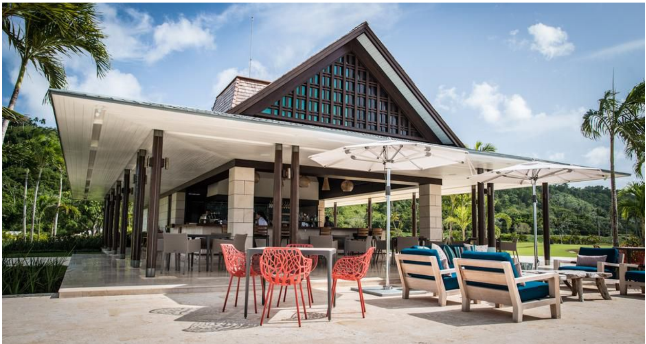
On the golf course itself there are three signature Discovery comfort stations: Las Brasas restaurant is located near the 1st tee and serves fresh farm-to-table cuisine (seen here).

Unlike other Dominican residential/golf developments, which have thousands of members and are open to the public, Playa Grande Golf and Ocean Club will cap membership at less than 500; moreover, membership in the club is extended only to property owners. Currently the membership fee is $125,000 with annual dues at $25,000.